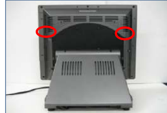
3. Unscrew two screw to remove unit from base stand.