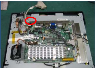
7. Tie the LPT cable to the I/O metal with a white tie.

Note : Red line on LPT cable to pin 1 on motherboard.