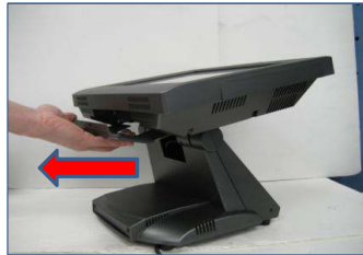
2. Remove I/O plastic cover and unplug all cables.