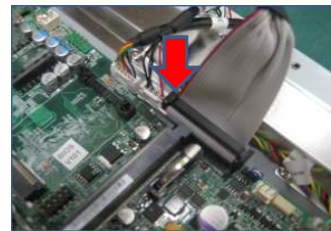
6. Install LPT extension cable to connector on motherboard.

Note : Red line on LPT cable to pin 1 on motherboard.