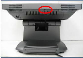
1. Unscrew I/O cover